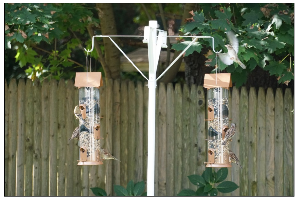
Sony A6300 APS-C, 55-210 mm at 210 mm, f/8, 1/800 sec, ISO 3200, 40 feet, Handheld