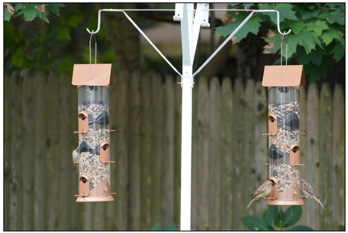
Sony A7RIII FF, 150-600 mm at 400 mm, f/8, 1/640 sec, ISO 3200, 40 feet, Monopod