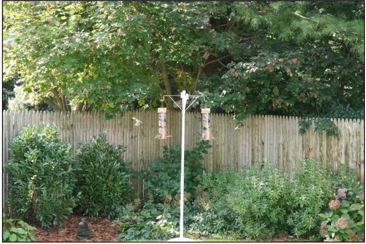
Sony A6300 APS-C, 55-210 mm at 55 mm, f/8, 1/640 sec, ISO 3200, 40 feet, Handheld