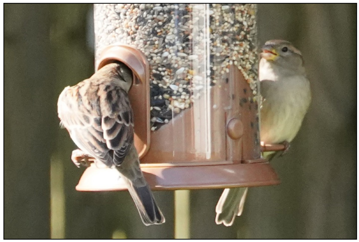
The image above was cropped 1/6th from the 300 mm photo taken with the A7RIII