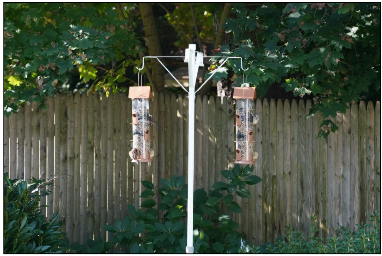
Sony A7RIII FF, 70-300 mm at 200 mm, f/8, 1/800 sec, ISO 3200, 40 feet, Handheld