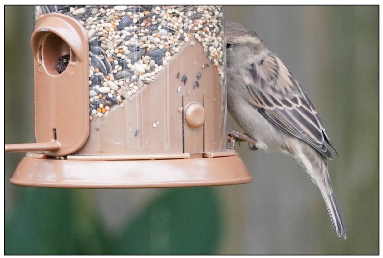
The image above was cropped 1/4th from the 600 mm photo taken with the A7RIII

Notice the higher resolution in the photograph above because the crop was not as significant (1/4th) using the 600 mm lens than the shorter 210 mm (1/6th) and 300 mm (1/7th) focal length lenses.