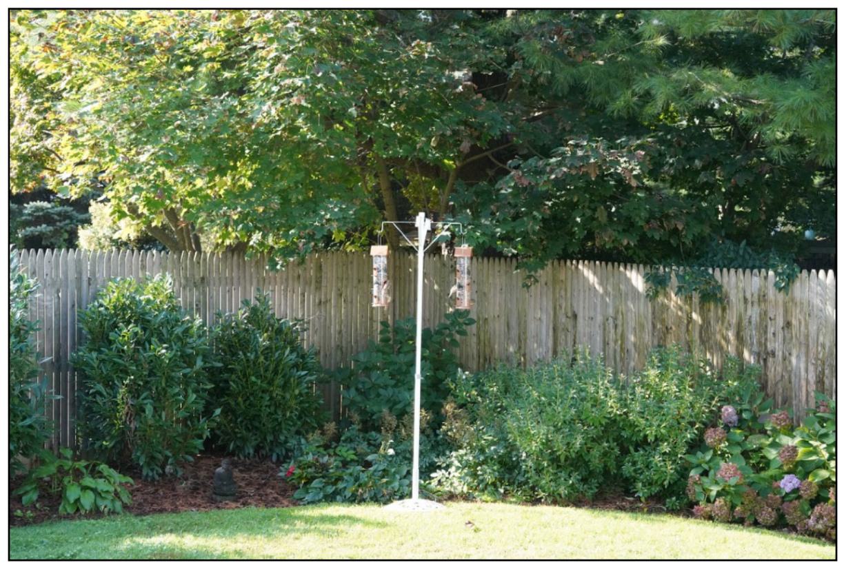
Sony A7RIII FF, 70-300 mm at 70 mm, f/8, 1/500 sec, ISO 3200, 40 feet, Handheld