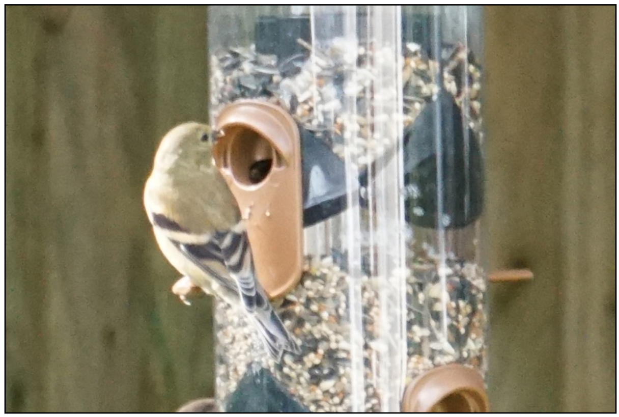
The image above was cropped 1/7th from the 210 mm photo taken with the A6300