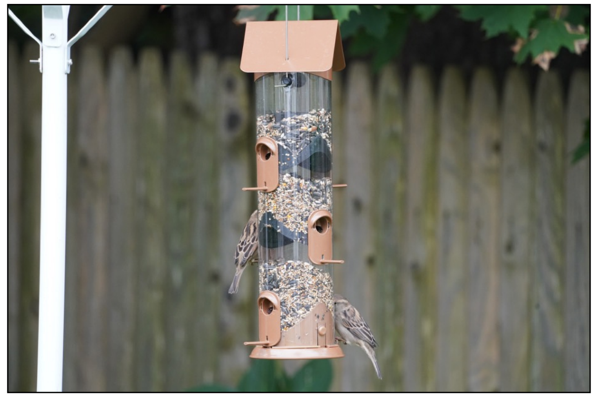
Sony A7RIII FF, 150-600 mm at 600 mm, f/8, 1/500 sec, ISO 3200, 40 feet, Monopod