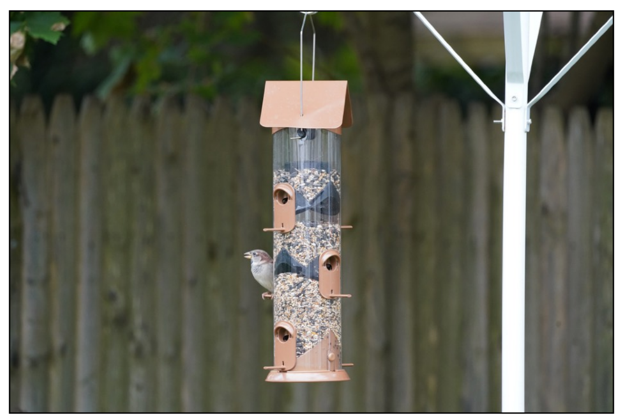
Sony A7RIII FF, 150-600 mm at 500 mm, f/8, 1/640 sec, ISO 3200, 40 feet, Monopod