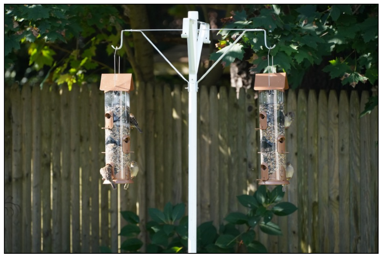
Sony A7RIII FF, 70-300 mm at 300 mm, f/8, 1/1000 sec, ISO 3200, 40 feet, Handheld