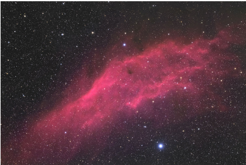
D810a Sample from Nikon